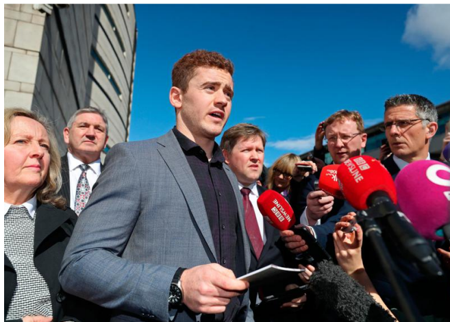
Nine weeks of evidence: Paddy Jackson speaks outside of court after he was found not guilty of rape this week.